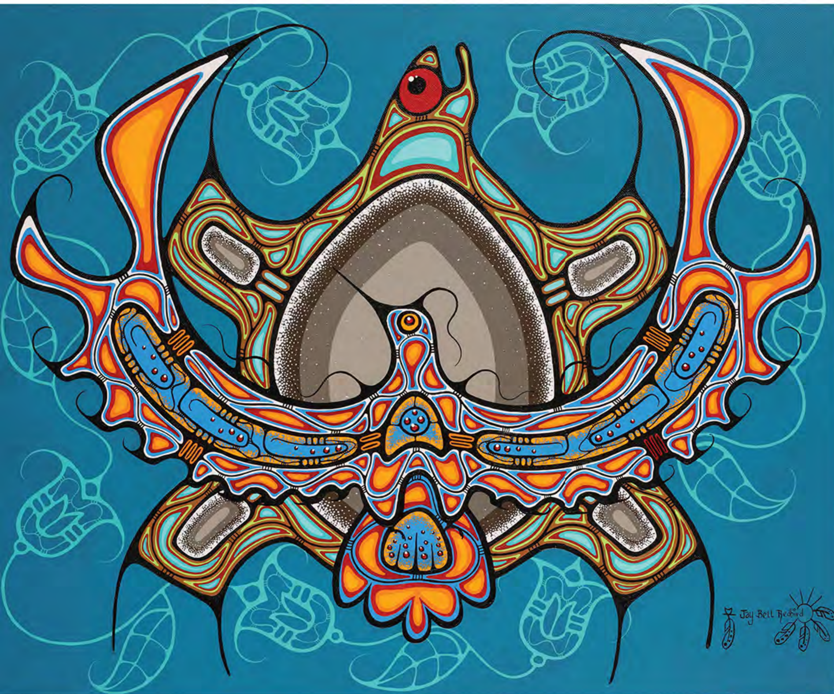
left, New Beginning of Love , acrylic on canvas, 20" x 24"