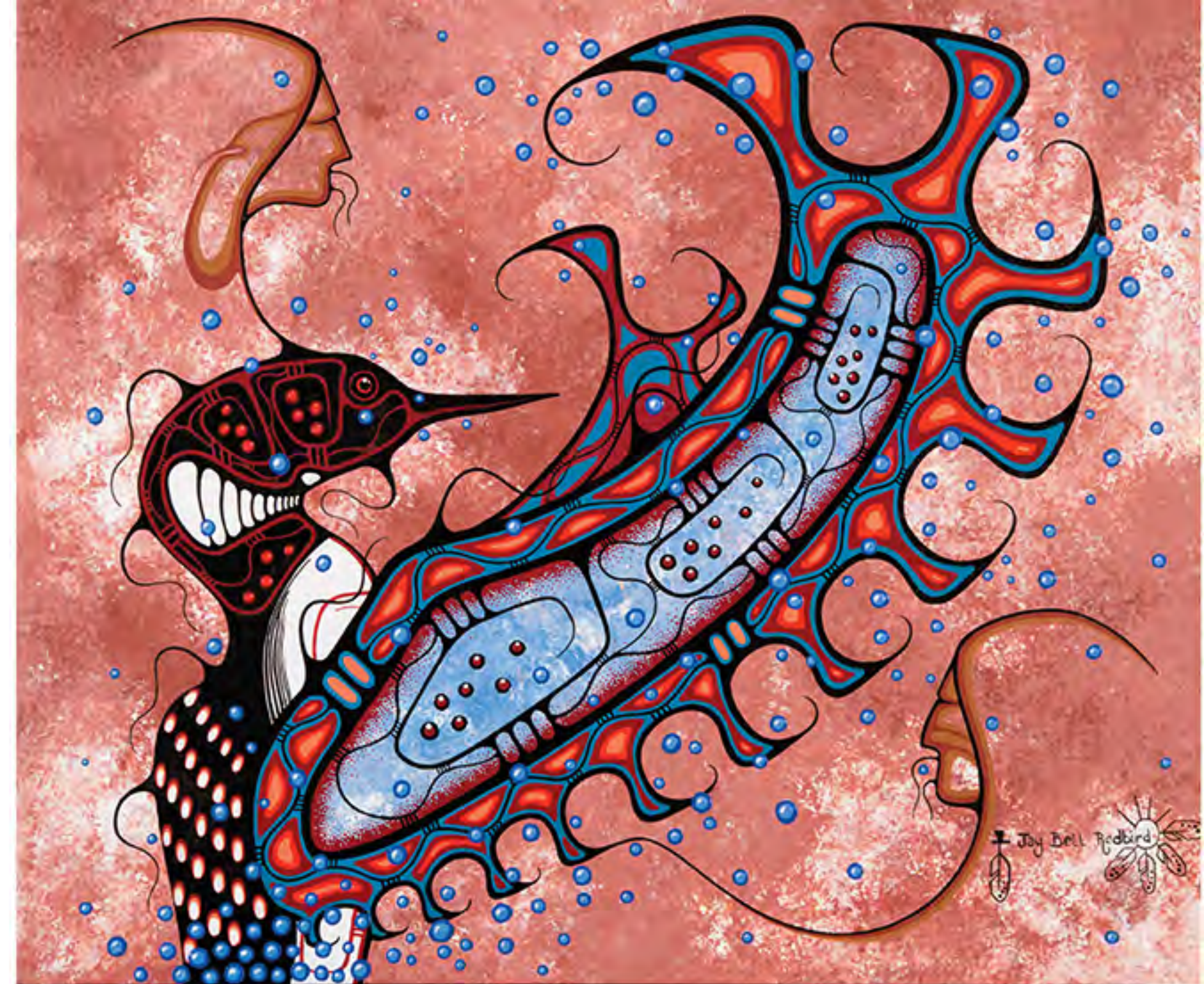
above right, Woman and Man is Loyalty , acrylic on canvas, 20" x 24"