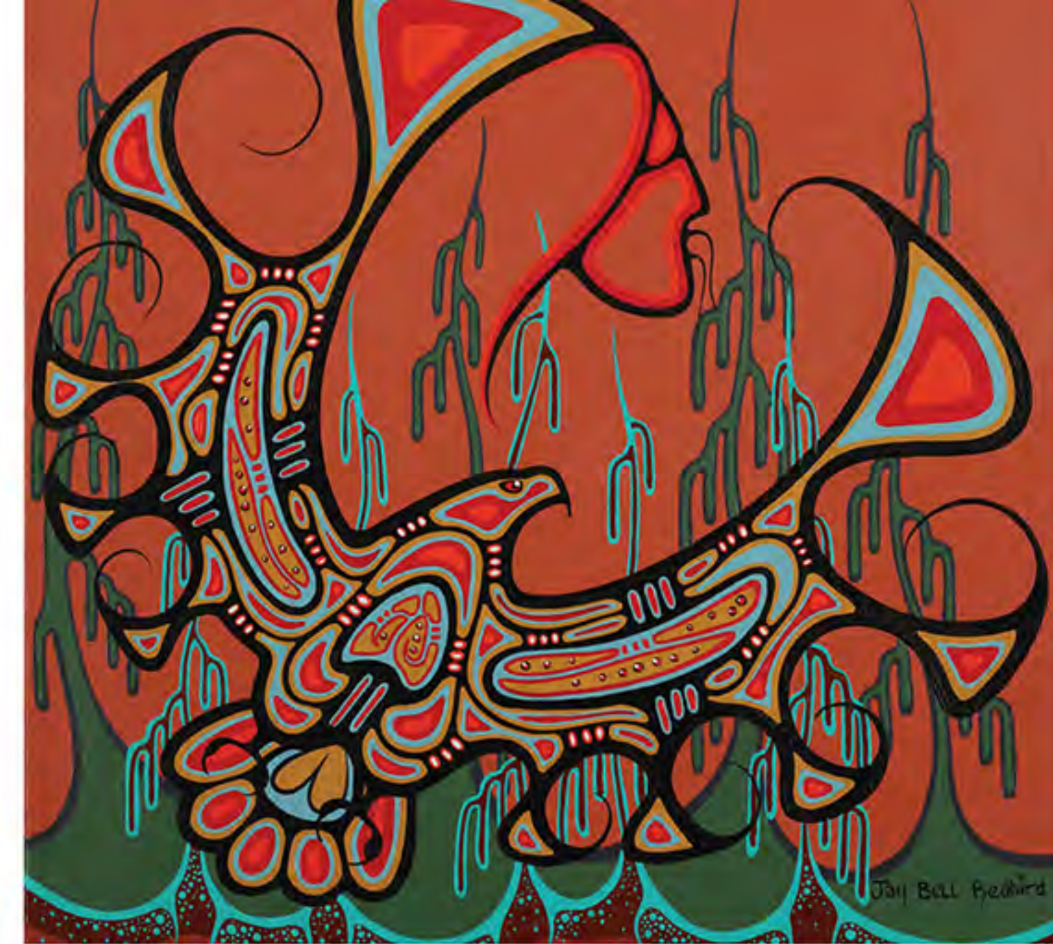
above right, Sharing Your Love , acrylic on canvas, 14" x 14"

mysticism. He founded the Woodlands School of Canadian art and was a prominent member of the "Indian Group of Seven."