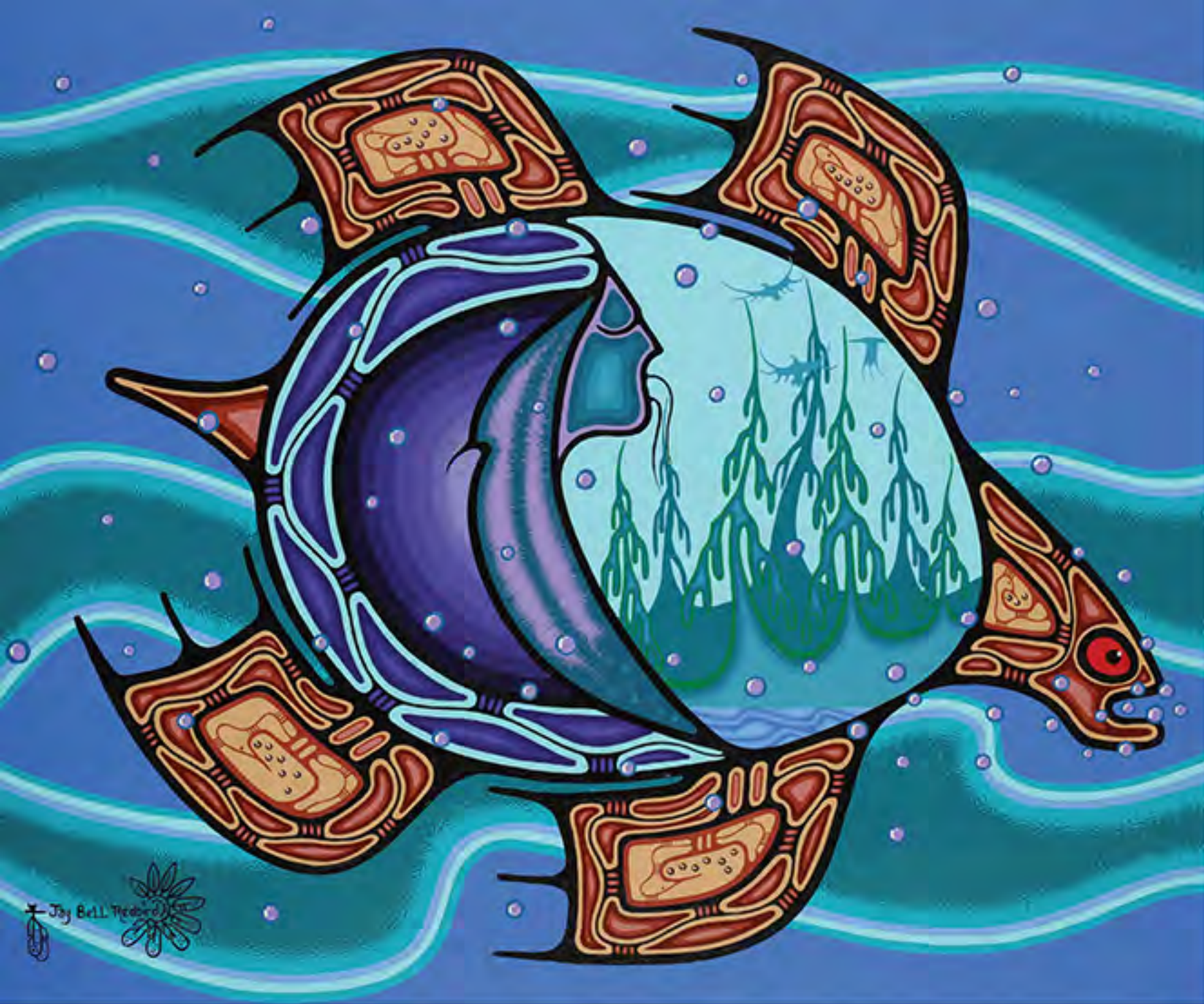
above left, Respect Mother Earth , acrylic on canvas, 36" x 30"