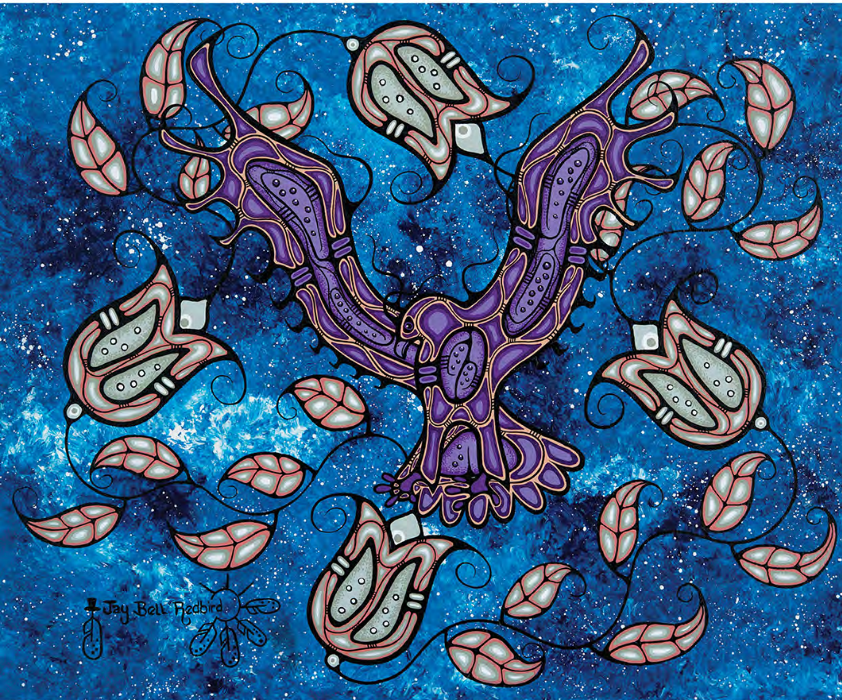
Previous Page, Loyalty of our Seven Grandfathers Teaching , acrylic on canvas, 60" x 40" This Page, left, Thunderbird Love , acrylic on canvas, 20" x 24"