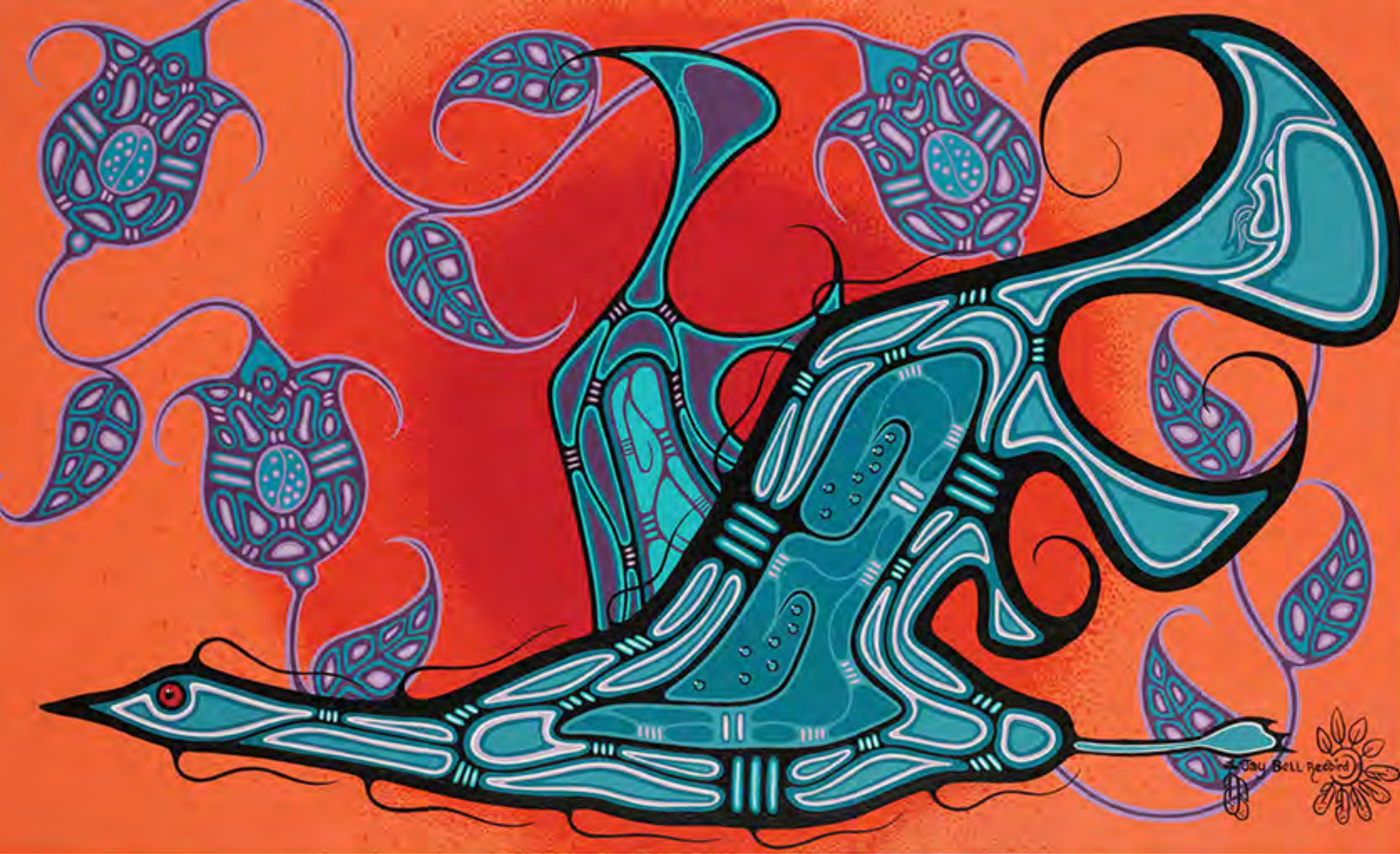
above left, Grandfathers Teachings , acrylic on canvas, 18" x 30"